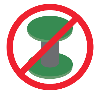
I-Orientation Avoid standing rolls on end